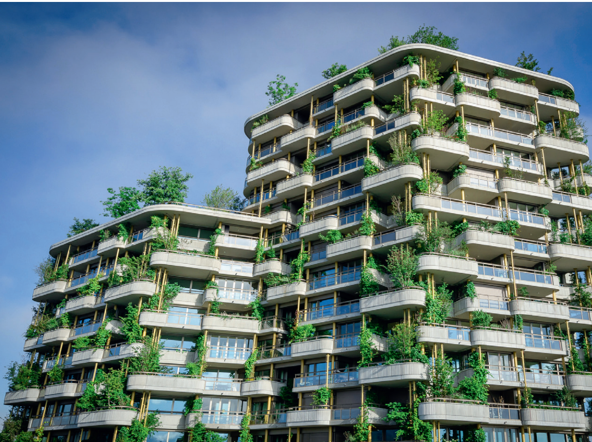
Garden high-rise in Switzerland.